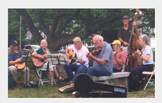
Pine Street Pickers

The Barking Claw will be on site selling their delicious lobster rolls and all-beef hot dogs. Sea Scoops will also be selling their yummy ice cream! Bring your chairs or blankets and enjoy this free family friendly event!